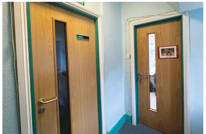
Two of the new fire doors installed in the offices of ESTEEM

“We had some very old, heavy fire doors without glass panels,” explains Joel Carter, Head of Safeguarding and Participation at ESTEEM. “The building looked very dated, and we were not meeting accessibility and safeguarding requirements without these glass panels. Many of the young adults who access ESTEEM are autistic or have sensory needs.