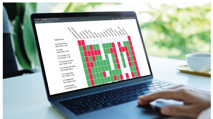
DorTrak generates easy-to-understand reports automatically, so you can quickly see which doors have passed or failed