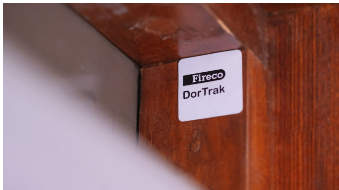
All doors inspected using DorTrak have a DorTrak tag, providing quick access to reports

“The client in particular has completed fire door inspections in the past and been left disappointed with the end result. There was a lack of a complete list of all fire doors on site. Also, there was no real organised collection of compliance documents relating to a fire door’s installation or condition.”